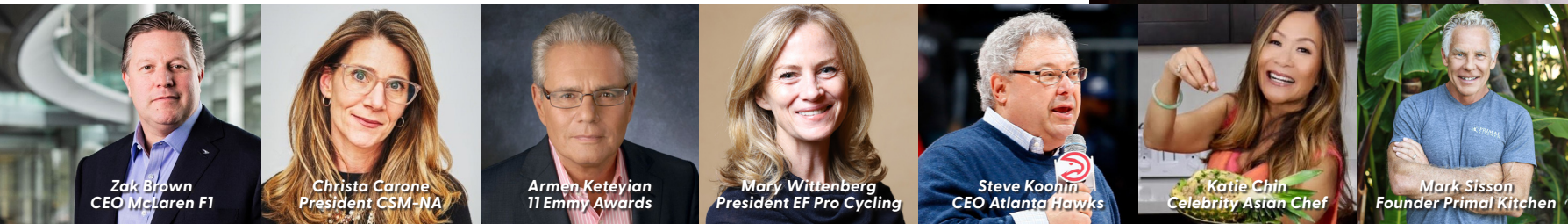
Zak Brown CEO McLaren F1